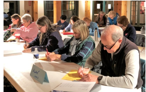
Fall 2018 students

For more information on the MMGA Home Horticulture Evening Lecture Series, email us at HomeHort@MassMasterGardeners.org